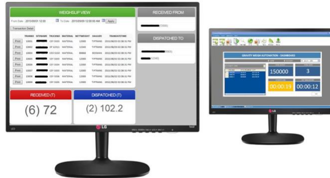
CWCSA Gravity Software System

Additional solutions integrating into gravity: